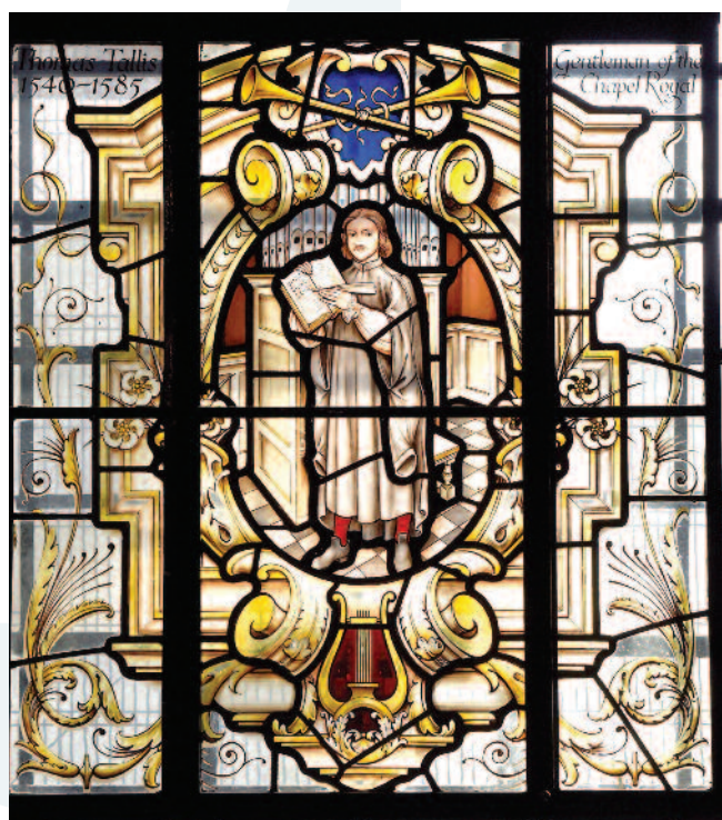
Thomas Tallis stained glass window

The murder of Alfege, here in Greenwich, led to the building of the first church. It was rebuilt in the 13th century, and later, with Greenwich Palace not far away, was fortunate to have Thomas Tallis as church organist. It is also believed that Henry VIII was baptized here.