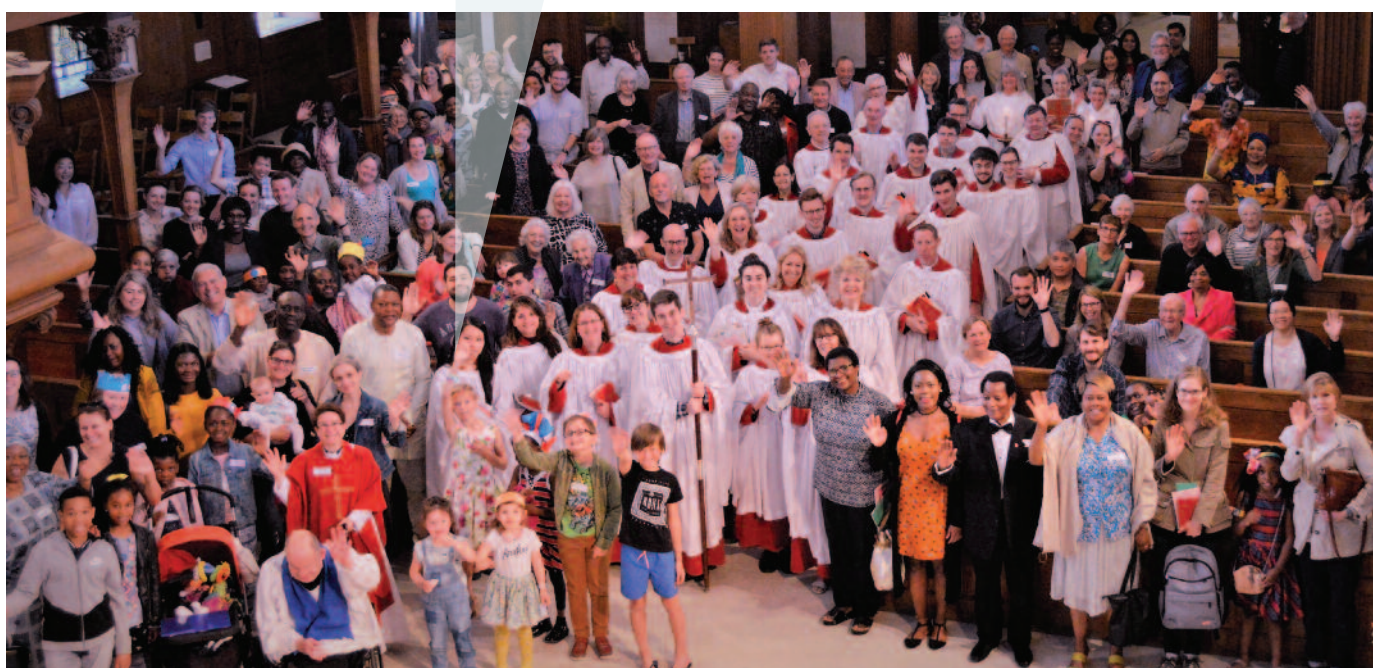
St Alfege Church congregation and choir

St Alfege Church plays a major role in the religious and cultural life of Greenwich. The average number of regular attenders is 182, (292 on the electoral roll; communicants 130) which does not reflect the very large number of people who pass through our doors each week, for concerts and recitals or as pilgrims or visitors. A volunteer programme helps the church to stay open every day between 11am and 4pm (noon on Sundays).