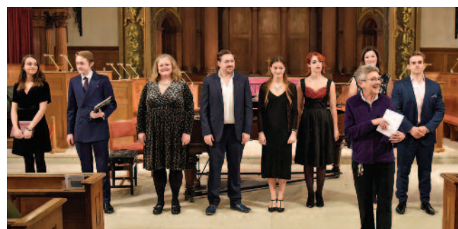
Free lunchtime recitals