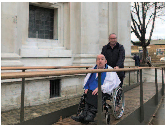
New access ramp