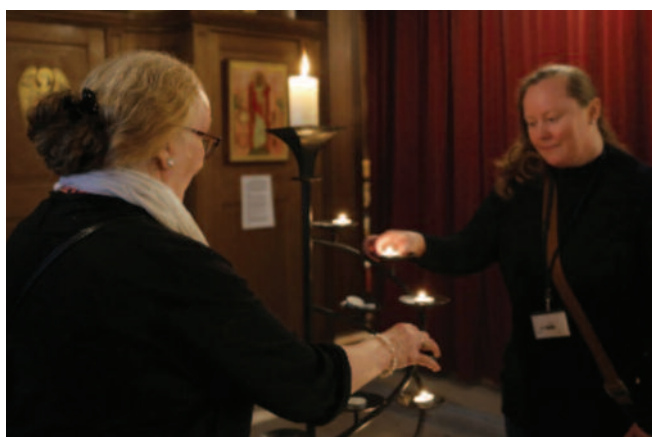
Lighting a candle