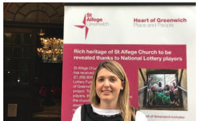
Heart of Greenwich Place and People

The project aims to reinforce the church's position as a heritage asset at the heart of Greenwich, reveal and interpret our hidden spaces and heritage for visitors, school children, their families and a diverse local community. Vital repairs to the fabric are bringing to light the splendid work of Nicholas Hawksmoor, improving access to and facilities in the church. Landscaping including a community memorial garden, signage and interpretation will be enhanced. The project will offer a comprehensive programme of community engagement activities in the future.