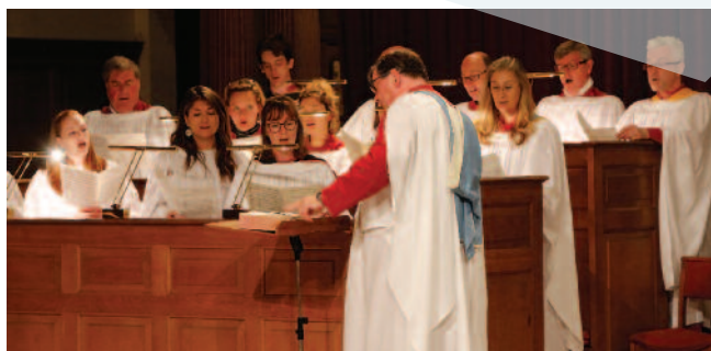
St Alfege Church choir

St Alfege Church has a peal of 10 bells which are rung for Sunday services and for weddings and other special events and occasions.