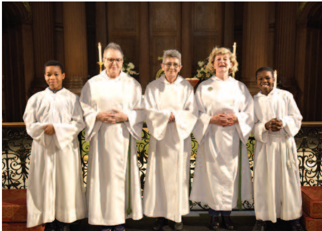
Servers at 10am Parish Eucharist

St Alfege is a central mainstream church. We are of the liberal catholic persuasion with the Eucharist at the centre of our acts of worship. At our main Sunday service, we follow Common Worship, Order One in traditional language and the Book of Common Prayer. Members of the congregation appreciate a stimulating sermon. The church is renowned for its quality of music, with an excellent choir (cathedral standard) which takes part in the main sung Eucharist on Sundays, monthly Evensong, Advent, Nine Lessons and Carols and other services. There is also a service of Holy Communion using the Book of Common Prayer at 8am on Sundays and on Thursday mornings.