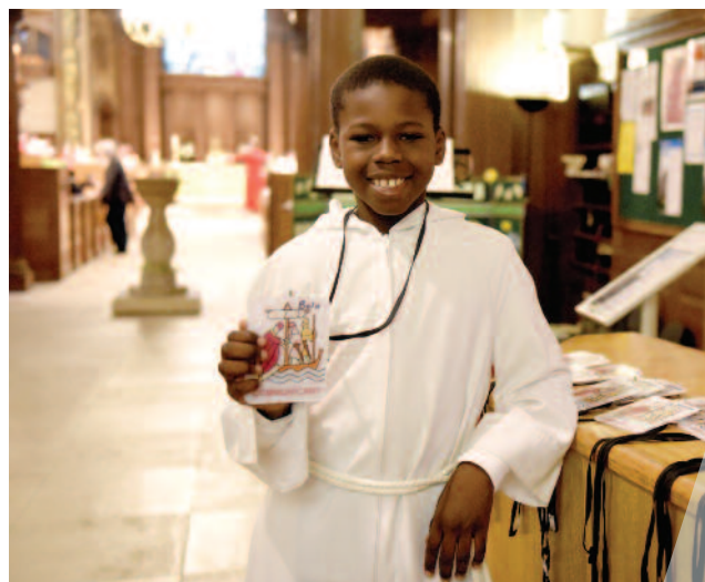
Young communicant from Children's Church

Clergy and Lay members of the congregation ensure that there are regular weekly services held for residents of the almshouses within the parish.