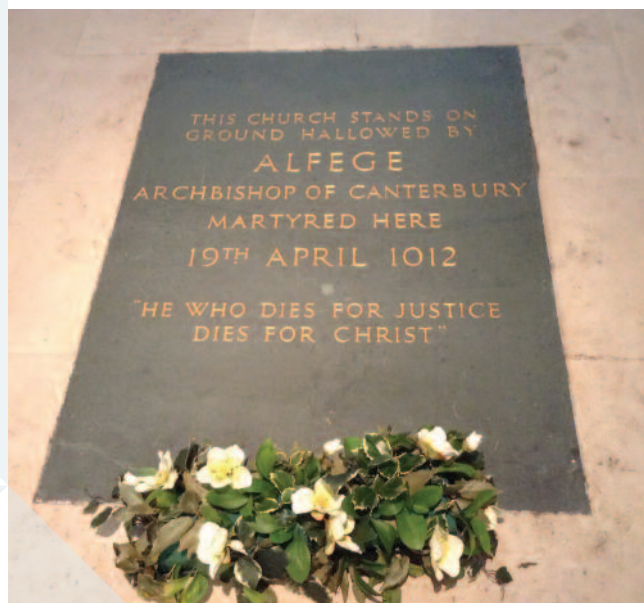
St Alfege memorial stone

History at St Alfege Church begins in 1012 when Alfege, Archbishop of Canterbury, was taken hostage by Viking warriors after they burnt down his cathedral during a raid on the city. He was taken to Greenwich, his captors hoping to ransom him for 3,000 gold marks, a huge sum of money. St Alfege refused to be ransomed, knowing it could mean starvation for many of his people, and as a result he was martyred. In the floor of the church in front of the altar, you can see his memorial, inscribed with the words: 'He who dies for justice, dies for Christ' (St Anselm).