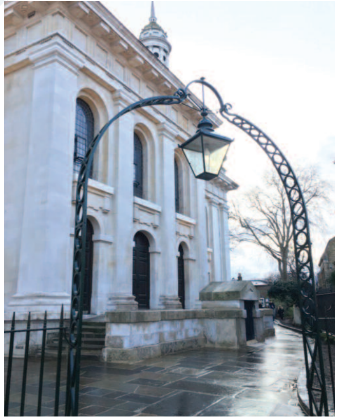
North courtyard and new entrance

The hall is used for children's parties at weekends, for receptions for concerts and recitals, and for receptions after weddings and baptisms in church. It is also used for church and charity social functions.